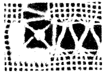
Sampler II: An easy solution to a small open corner.