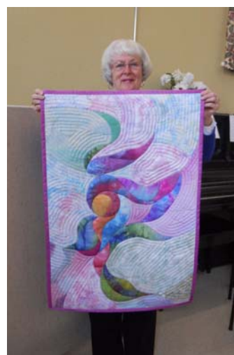
Sally's silk wall hanging ready for the next show.