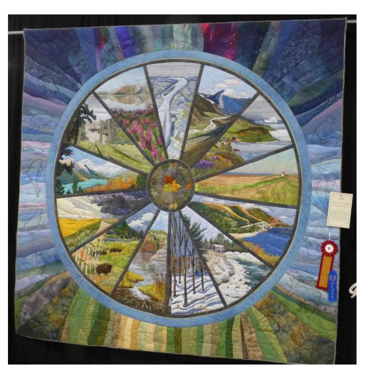
First Place: Kingston Heirloom Quilters for "Our Canadian Landscape Quilt"